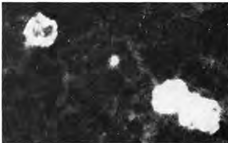
Photomicrograph of Plasmodium vivax under ultraviolet light.

Coming at the present time, the new procedure assumes an added significance in view of the further diagnostic difficulties now being imposed on the already overburdened technician with the recent discovery that monkey malaria may provide a permanent reservoir for the disease.