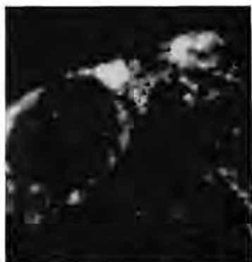
Fluorescent-antibody stained Rickettsia in a tissue fragment of intestinal diverticulum of infected tick.

The authors conclude that the complement fixation test can be used successfully to detect antibodies following infection with Colorado tick fever virus. They emphasize that serums for the test should be collected four weeks or longer following onset of illness. The test should prove of value, they believe, in general diagnostic laboratories as confirmation of the clinical diagnosis of the disease.