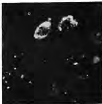
Suckling mouse brain infected with Colorado tick fever virus shows the reaction between antigenic material and labeled antibody globulin in cytoplasm of Purkinje cells.