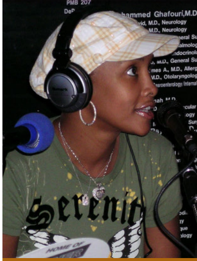
ABOVE • Actress Vivica A. Fox gives NIH outreach a boost. See story on p. 2.