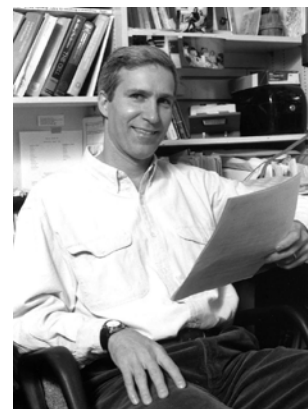
Dr. Douglas Lowy (top) and Dr. John Schiller are Federal Employees of the Year.