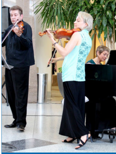
ABOVE • NSO musicians visit NIH for fourth time in a year; see p. 5.