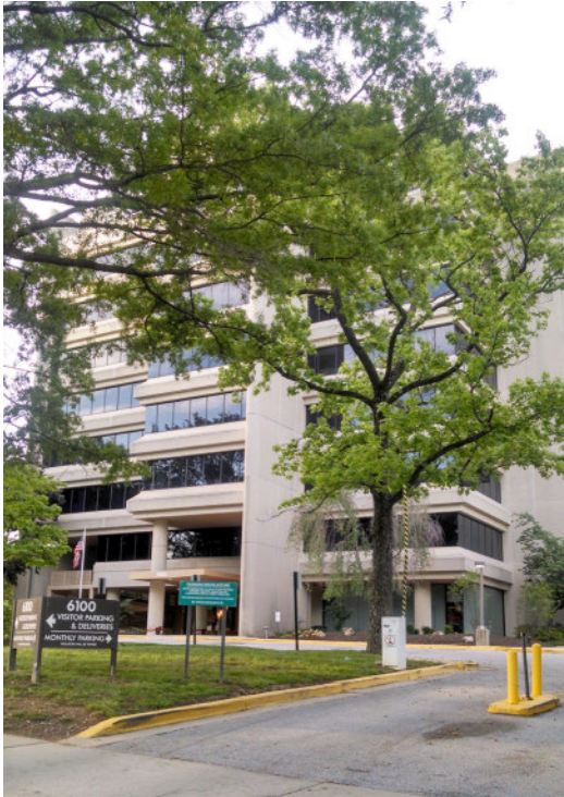
Structural problems have closed 6100 Exec. Blvd.