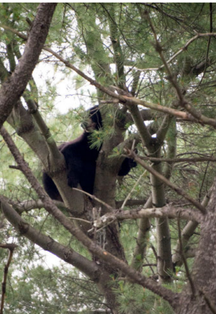
Above: The bear spent about 3 hours high up in a pine tree.