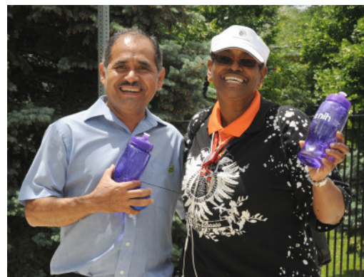
Happy hikers along the 3.25-mile NIH loop