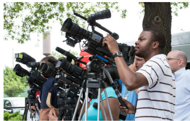
At left, the bear makes its way down the tree after hearing loud pops. Above, a media phalanx assembled to track the animal.