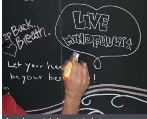
One of several chalkboard-signing messages offers good advice.