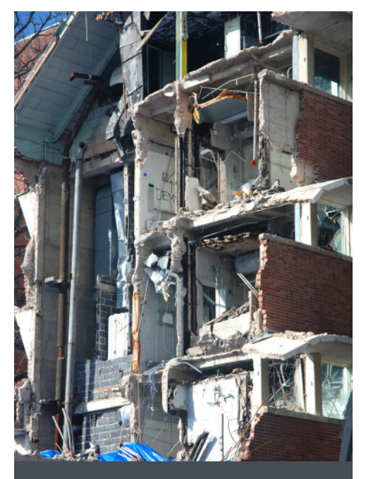
Exposed face of partially flattened building

On Sept. 4, demolition started. To minimize dust, workers sprayed water on the parts of the building they were tearing down. Shortly thereafter, Clifford said, a crew found previously undiscovered pipes in a hidden shaft. The pipes were suspected to be insulated with asbestos. Work stopped immediately and MDE was notified. Tests