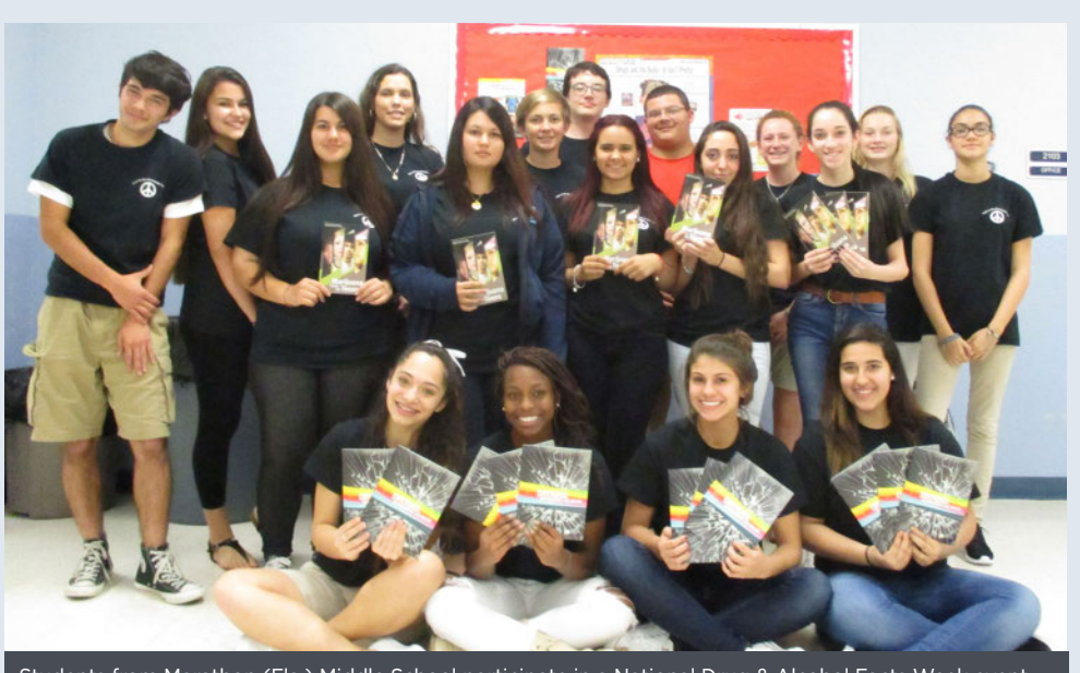
Students from Marathon (Fla.) Middle School participate in a National Drug & Alcohol Facts Week event.

promoted throughout the week via social media outreach on Twitter and Facebook. Online resources included five new drugspecific toolkits for event holders to use and the popular National Drug IQ Challenge,