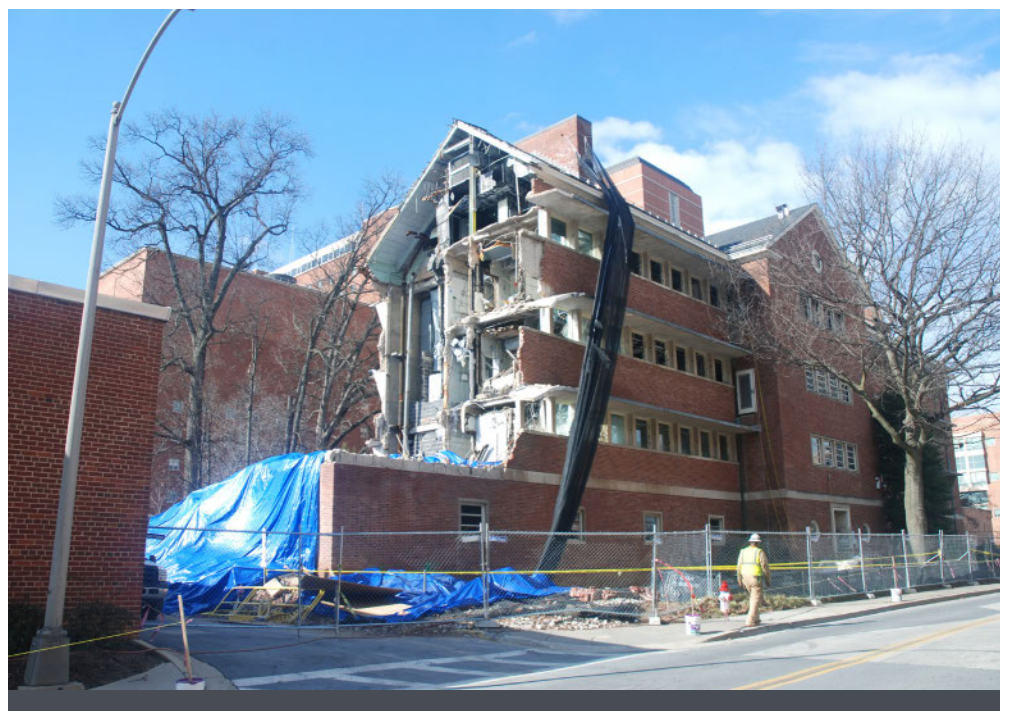
Work came to a halt on the demolition of Bldg. 7 after asbestos was found in the debris. The project will resume once abatement is complete.