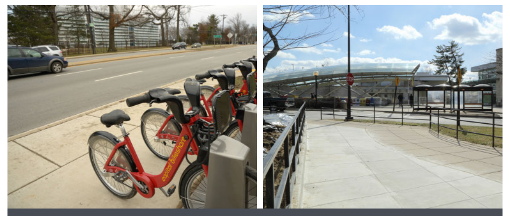
A Capital Bikeshare dock (I) across from Bldg. 35 provides a model of what the new one will look like at a site (r) near the Medical Center Metro plaza.

Riding a bike, even at a leisurely pace, is great exercise. NHLBI studies show that an hour of cycling