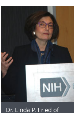
Columbia University discusses frailty.

among those who study older adults: A gerontologist can spot frailty at 50 yards. Fried examined it much more closely—"from cells