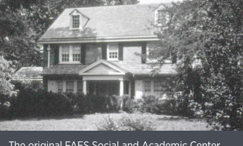
The original FAES Social and Academic Center still stands at the corner of Old Georgetown Rd. and Cedar Ln.

Some 60 years ago, 11 visionary NIH scientists built a bridge—or more precisely, a virtual network of bridges-to help newcomers navigate the intramural research community. Today, that vast infrastructure, a nonprofit called the Foundation for Advanced Education in the Sciences (FAES), Inc., not only provides a pre- and postgraduate-level academic program with 150 courses and 40 core biotechnology training workshops yearly, but also sponsors concerts, book readings, scientific lectures, symposia and other cultural events, administers a