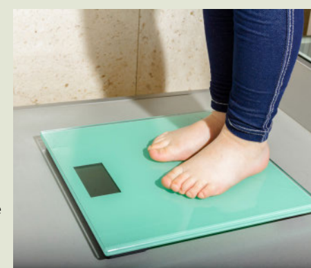
Children born to women who have high blood levels of lead are more likely be overweight or obese, compared to those whose mothers have low levels of lead in their blood.

Among women who had high lead levels, the risk of their children being obese or overweight decreased if the women had adequate levels of folate 24 to 72 hours after giving birth. The U.S. Preventive Services Task Force recommends that all women of reproductive age consume 400 micrograms of folic acid (the synthetic form of folate) each day to help prevent neural tube defects, a class of birth defects affecting the brain and spine. Women in the study had earlier responded to a questionnaire indicating whether they had taken a supplement containing folic acid in the second and third trimesters of pregnancy. The authors note that if their results are confirmed, testing pregnant women for lead exposure and then offering folic acid to those who have high levels could potentially reduce their children's risk of being overweight or obese.