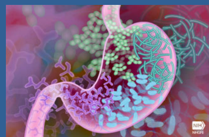
ON THE COVER: Bacterial strains in the guts of humans and chimpanzees diverged and began to evolve separately 5 million years ago, and 15 million years ago in humans and gorillas. Humans and apes evolved into a new species at about the same time. A mutually beneficial relationship between gut bacteria and animal hosts may contribute to formation of a new species.