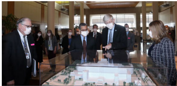
In the CRC atrium, HHS Secretary Xavier Becerra (2nd from l) and Deputy Secretary Andrea Palm (r) view the hospital model with NIH principal deputy director Dr. Lawrence Tabak (l) and NIH director Dr. Francis Collins.