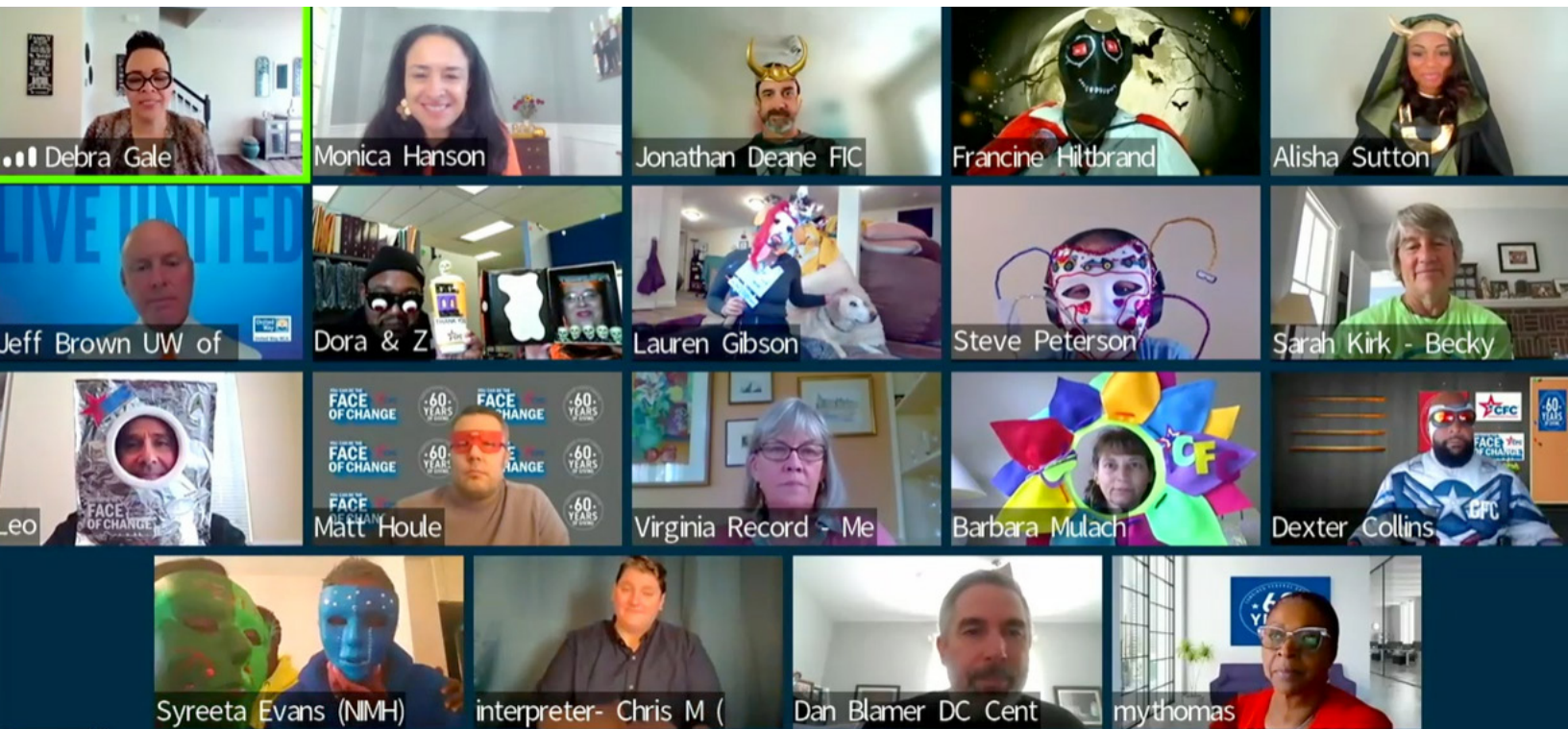
NIH'ers displayed their artistic talents and dramatic flair during the recent CFC Halloween Charity Fair and mask contest.