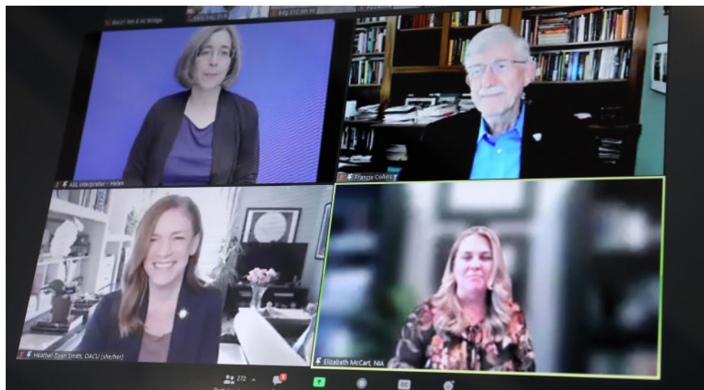
NIH director Dr. Francis Collins (top, r) celebrates animal care workers in virtual conference call.