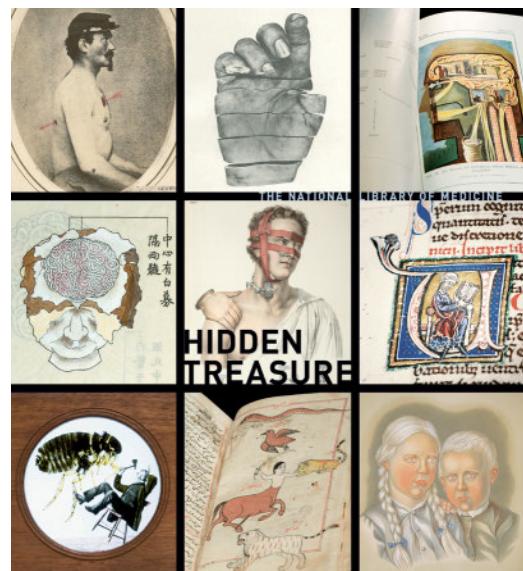
Cover of Hidden Treasure