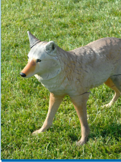
ABOVE • Campus coyotes are back in storage after scaring off Canada geese. See story on p. 3.